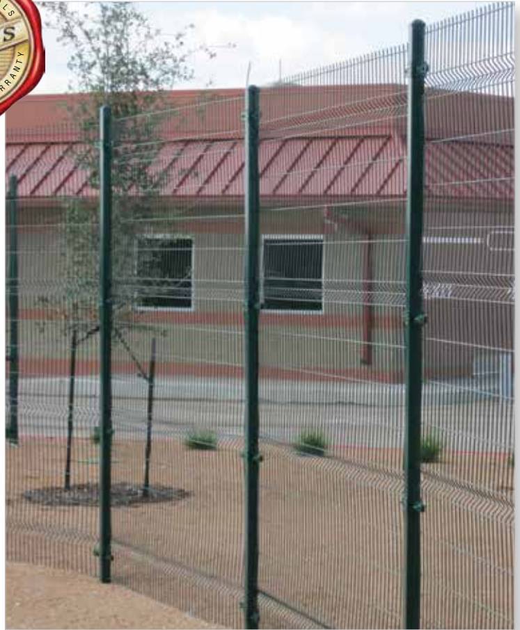
8 ft. Tuf-Grid® Welded Wire, Green